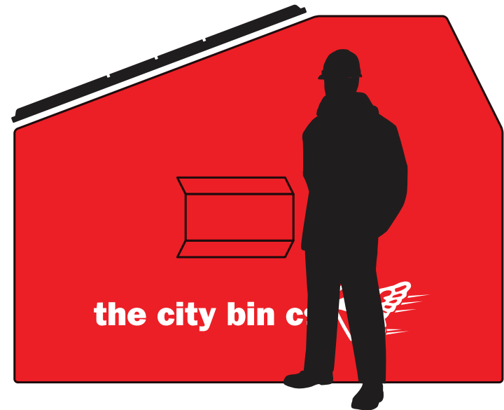
8 Cubic Yard