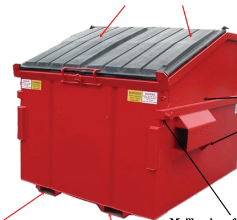
All section joints mitred and fully welded