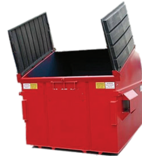
Side Hinged Double skinned Duraflex plastic lids are lockable